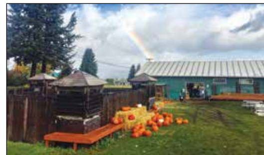
Explore our remodeled Bin Fort

An extraordinary opportunity to taste over 120 varieties of apples and 24 varieties of European and Asian pears. You'll be amazed by the unique contrasting flavors perfect for snacking and baking. Taste a bit of history as we offer apple varieties spanning more than 200 years of cultivation. The unique Mtn. Rose, luscious Ambrosia, Crimson Crisp and many other exotic assortments are sure to peak the curiosity of all inspired to participate. Enjoy a taste of Reverend Nat's Hard Cider. Spend the day, have a picnic, pick your own new found favorites, take a hay wagon ride, and tour the orchard. Nominal tasting charge to taste over 120 varieties of apples and Asian pears.