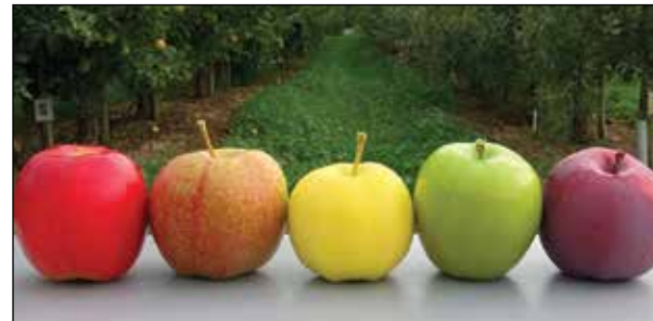
Over 120 varieties to choose from!

Come pick your own apples to the sounds of live music or join us for a delicious Mexican lunch while the kids enjoy participating in piñata fun. This is at the height of our season when the largest variety of fresh fruit and produce are available. Self-guided orchard tours, hay wagon rides, and amazing Mt. Hood views.