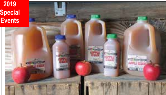
HoneyCrisp apple cider is crisp and refreshing.