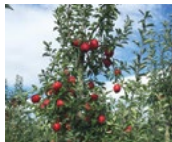
Crimson Crisp Apples